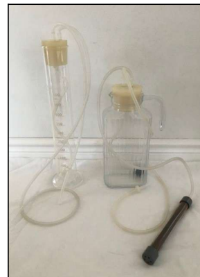
Ozonated water kit