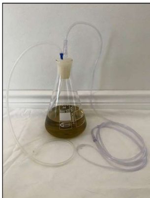
Ozonide breathing kit