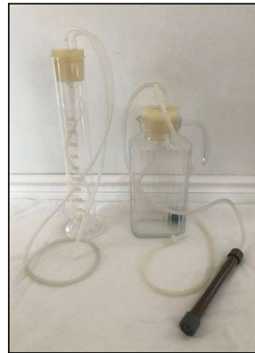
Ozonated water kit